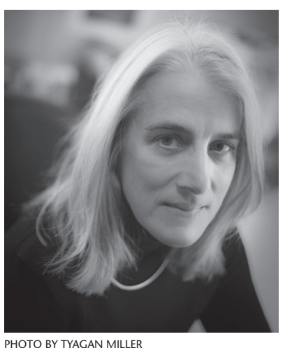
Louisville, Kentucky. She settled in Bloomington, Indiana, after experimenting with life on both coasts. She has been an editor for twenty-five years and is co-editor of Women with Wings: An Anthol-